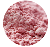
VITAMINA B-12 (METILCOBALAMINA)