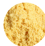
VITAMINA A (PALMITATO)