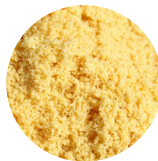
VITAMIN A (ALL- TRANS RETINYL PALMITATE)