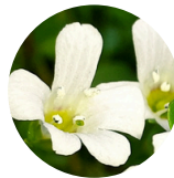
BACOPA MONNIERI EXTRACT