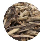
CAMELLIA SINENSIS (WHITE TEA EXTRACT)